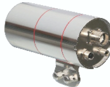
IA: Industrial, axial